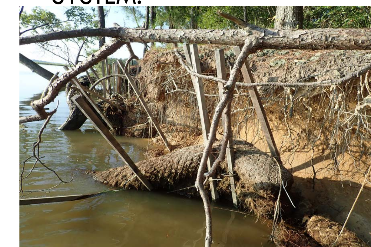
The oak stake anchors at site 44NN14 continued to pull up collapsing the stabilization.