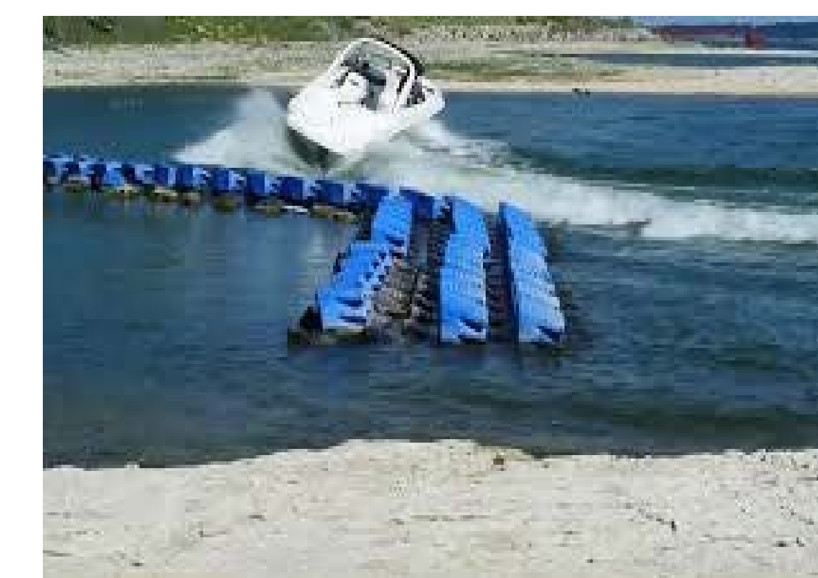
Floating breakwater technology for site stabilization is available at www.wavebrake.com