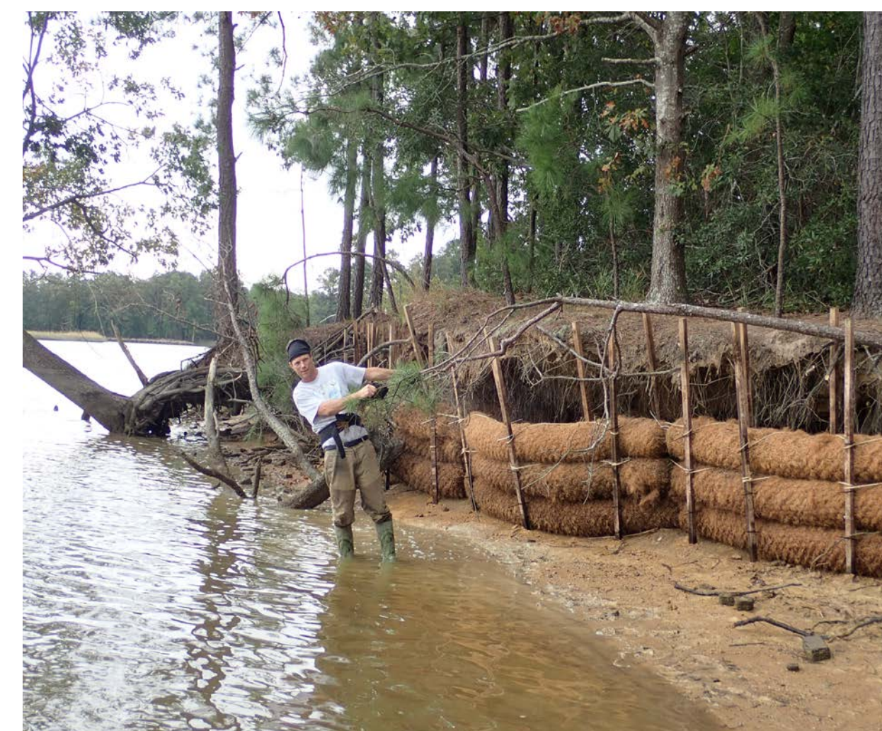
CSU monitoring director at the new coir log stabilization at 44NN14.