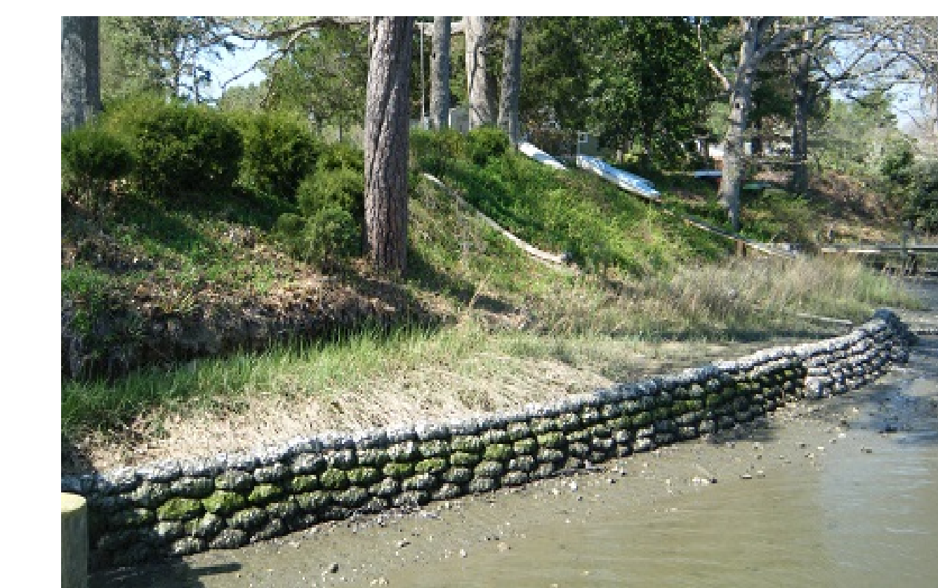
Oyster bag sills like this one illustrated by VIMS paired with floating stabilization and vegetation planting offer a more cost effective solution for long term site stabilization than traditional methods such as rip rap.